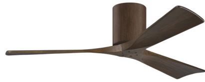
Shown in walnut / walnut tone

The Atlas Irene Hugger Ceiling Fan is rustic yet strikingly modern, with cleanly joined solid wood blades and a minimal cylindrical motor housing. Its streamlined profile with the warm, natural look of wood works beautifully in contemporary and transitional spaces. Equipped with a DC motor, the fan is energy efficient and ultra-quiet. A hand-held remote control and wall control are included, both able to turn the motor on/off and set 6 speeds and forward/reverse. For fans that have a light, the controls also turn the light on/off and dims it. Fans that have a light include a cap matching the housing finish for no-light use. Note: Some combinations of motor finish, blade color, and light option are not available. The 72 inch is available in a 3-blade only and is not available with a light option.