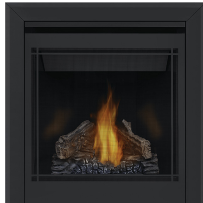
3" Premium Bevelled Trim