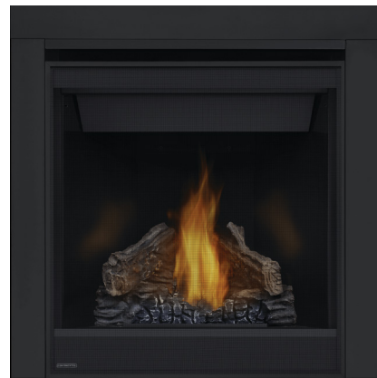
3" Trim Kit