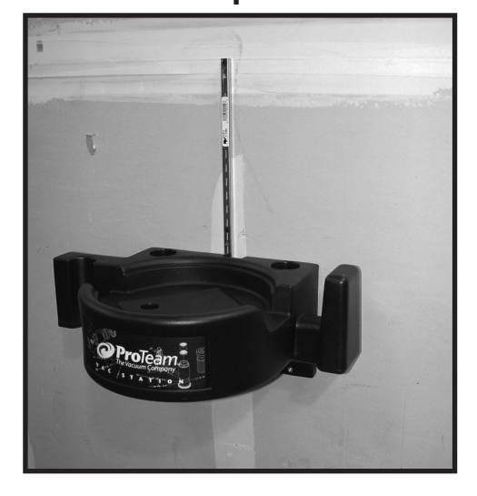
The proper height of the ProTeam Vac Station is determined by the user of the vacuum. The vacuum user should be able to back up to the Vac Station and without bending his or her knees or rising on the balls of his or her feet, slip the vacuum on or off of the Vac Station easily.