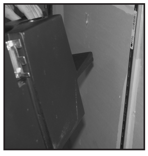
Line up the standard guide and mounting bracket on the Vac Station. Mount the vac station at the proper height. You may need to loosen the three mounting screws a little if the bracket doesn't slide into a secure fit.