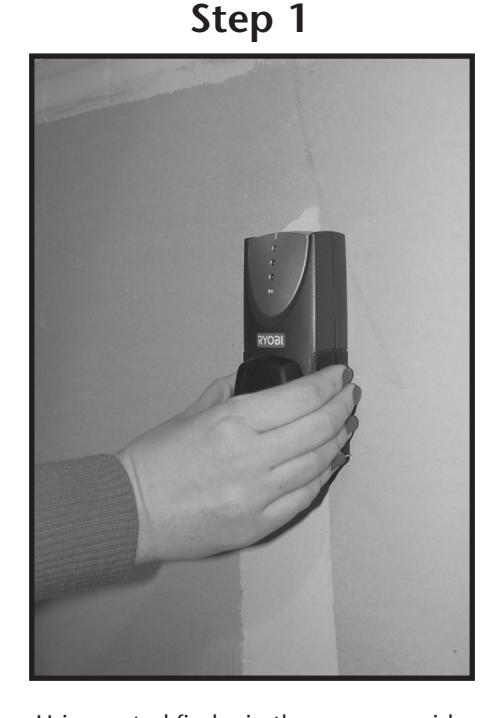
Using a stud finder in the area you wish to mount the ProTeam Vac Station, locate and mark a wall stud. Be sure to mount the Vac Station into a stud, not just the wall board or sheet rock.