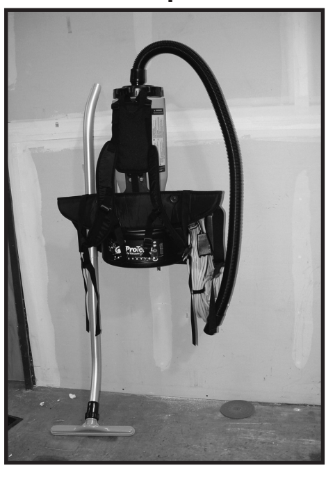
The ProTeam Vac Station has space to hold all of your ProTeam vacuum tools, power cord and filters.