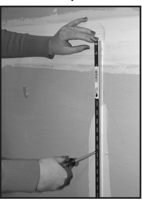
Using a drill with a 1/8 in. bit, drill a hole 2 in. deep on the mark you made in step 2. Line the middle hole of the wall bracket up with the hole and insert a wall bracket screw. Leave the screw loose for now.