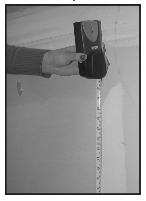
Using a tape measure, mark a spot on the wall 36 in. from the floor. This will be the location of the middle mounting hole and screw for the wall bracket.