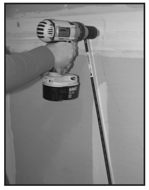
Rotate the wall bracket to the side and with the same 1/8 in. bit, drill two more holes 2 in. deep, one on each of the marks you made in Step 4.