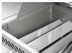
Dual-Level Stainless Steel Sear Plates