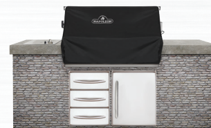
PREMIUM FITTED COVER #61666