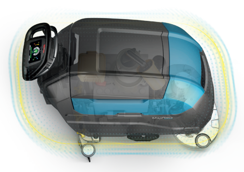
The outer body surrounds the internal structure and mechanical parts, protecting them from impact.