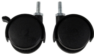
2x Locking Casters 2x Non-Locking Casters