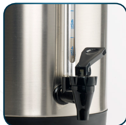
Drip less faucet with protected level indicator