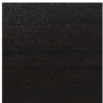
MH - MAHOGANY

STEP 2: ADD THE 2 LETTER CODE FOR THE BOARDS OF YOUR CHOICE