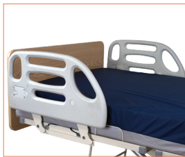
CR - COMPOSITE SWING RAIL