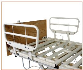
MR - METAL SWING RAIL

STEP 3: ADD THE 2 LETTER CODE FOR THE RAIL/BAR OF YOUR CHOICE