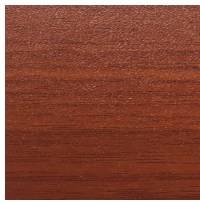
CH - AMBER CHERRY