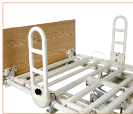
PB - PIVOT ASSIST BAR