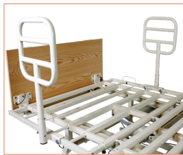
AB - ROTATING ASSIST BAR