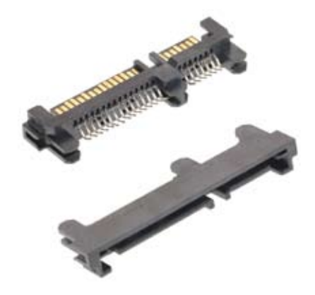
3M™ SATA Combo Device Plugs