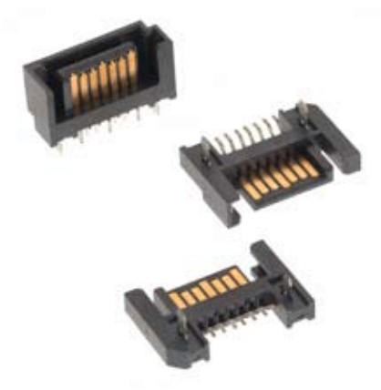
3M™ SATA Signal Plug, Boardmount, SMT Right Angle and PTH Vertical