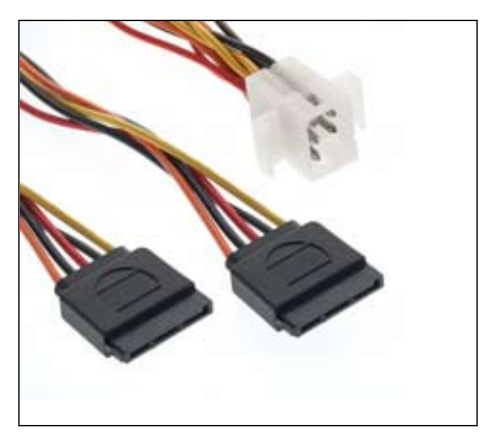
3M™ SATA Power Cable, Y Configuration