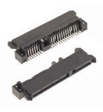
3M™ SATA Combo Receptacle