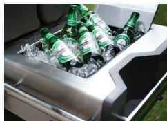
Integrated Ice / Marinade Bucket