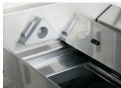
Dual-Level Stainless Steel Sear Plates