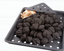
CAST IRON CHARCOAL / SMOKER TRAY #67732