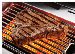
Infrared SIZZLE ZONE™ Side Burner