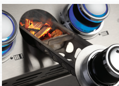
Integrated Wood Chip Smoker Tray