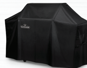
PREMIUM FITTED COVER #61665