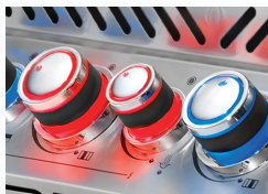
NIGHT LIGHT™ Control Knobs with SafetyGlow