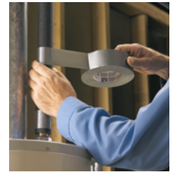
Installing and repairing