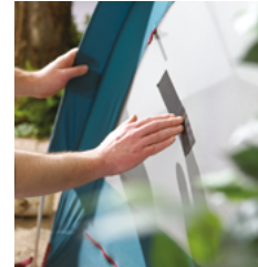
Repairing outdoor items