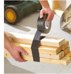
Bundling large loads