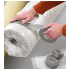
Securing loose items