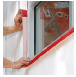
Masking exteriors prior to stucco applications

A heavy-duty poly stucco tape with 30-day removal engineered to last through multiple steps in traditional three-coat or hard-coat stucco and EIFS. This tape will resist the damaging effects of weather and stay put until the job is done. Prepping one time instead of three saves time and money.