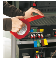
Color coding electronics