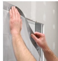
Hanging poly sheeting