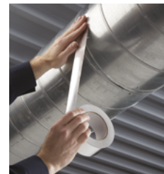
Sealing duct work