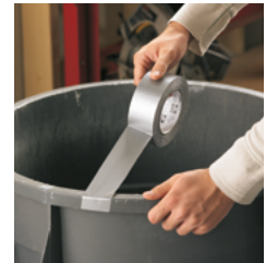
Repairing household items