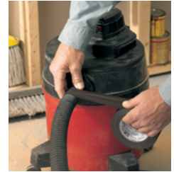
Repairing household items