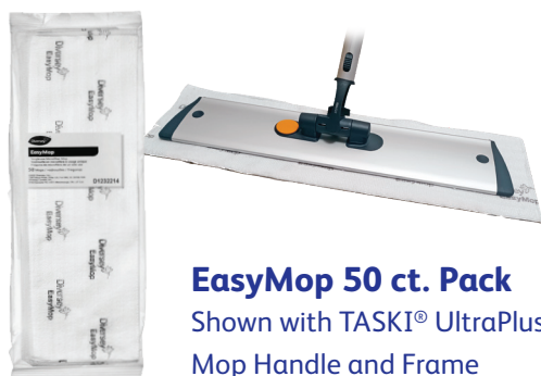
EasyMop 50 ct. Pack Shown with TASKI® UltraPlus Mop Handle and Frame