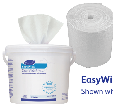
EasyWipe 125 ct. Bucket Shown with 125 ct. Refill

To learn more, contact your Diversey representative or visit diversey.com