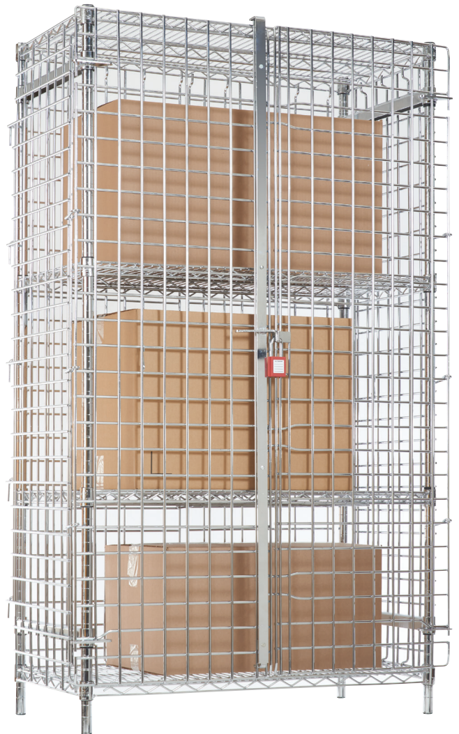
Locking bar secures door when closed.