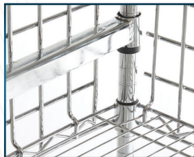
Panel clips into shelf for secure, tight fit.