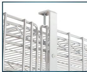
Pin on door locks into top and bottom shelves.