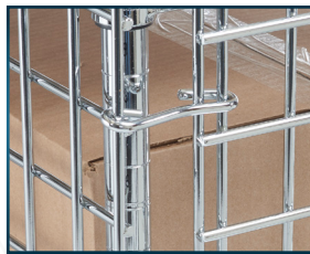
Wire hook-n-loop door and side panels for extra security.

Shelves, posts, and casters sold separately