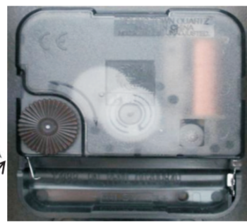
Time Setting Dial