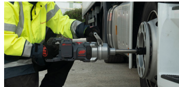
Fleet Truck Maintenance