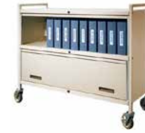
4724/4824 2 SHELF