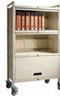
4732/4832 3 SHELF