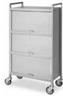
9283-04 3 SHELF