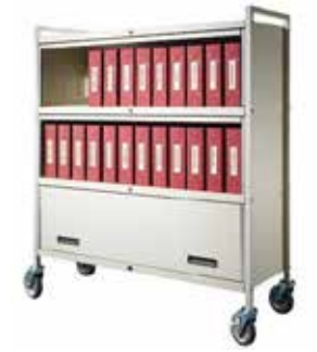
4734/4834 3 SHELF