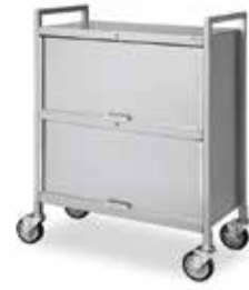
9282-04 2 SHELF