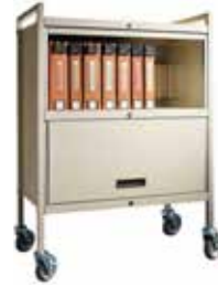
4722/4822 2 SHELF