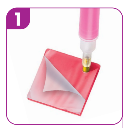
Peel the clear film off the wax then press & twist the tip of the stylus into the wax to fill it