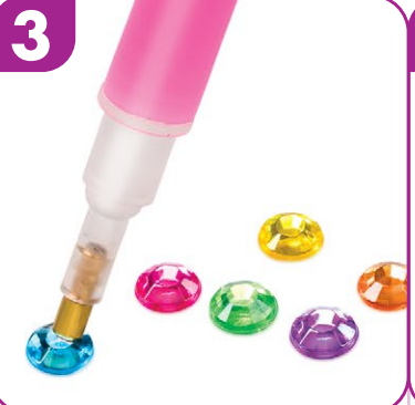
Pick up gems with the tip of the wax filled stylus. (When it stops working, refill it with more wax.)