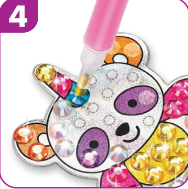
Place the gems on the adhesive dots. When finished, press down on the gems so they stay in place.