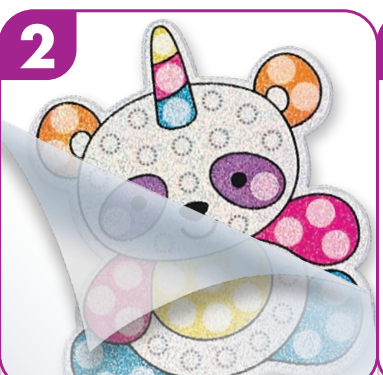
Peel off the clear protective cover to reveal the adhesive.