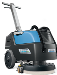
XM14SC Pro 14" Micro-Scrubber HIL56030