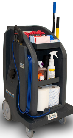
CC17XPC Corded HIL99247