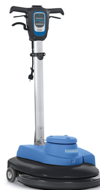
BU1500 1,500 RPM Burnisher HIL56022