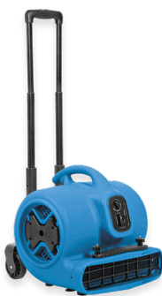
FD15 Floor Dryer Cord Electric HIL56015