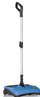
NS13 13" Sweeper HIL56000