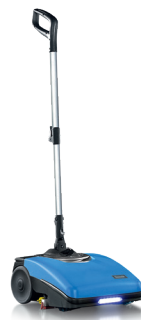
NM14 14" Cylindrical HIL56001