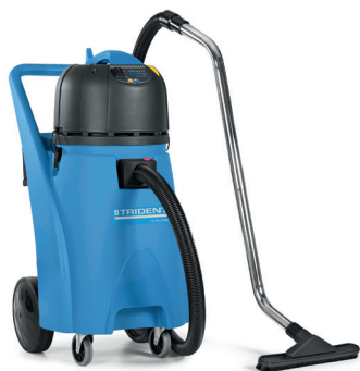
WD21V 21 Gallon Wet Dry Vac Cord Electric HIL56018