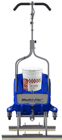
For Solvent-Based Gym Finish HIL50108