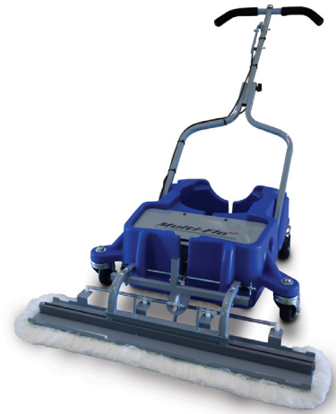
For Floor Finish HIL50110