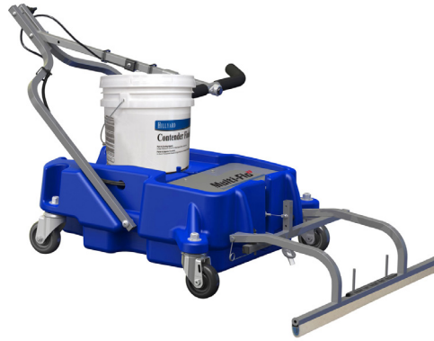
For Water-Based Gym Finish HIL50109