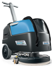
XM17SC PRO 17" Micro-Scrubber HIL56031