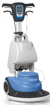
FMD17 17" Disc Floor Machine HIL56049