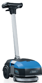
XM13SC 13" Micro-Scrubber HIL56004