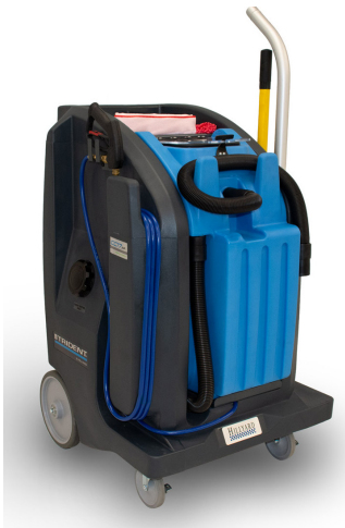
CC17XP Battery Powered Shown with 120V Vacuum Recovery HIL99245