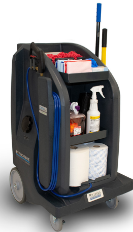
CC17HP Battery Powered High Pressure (275 PSI) HIL99246