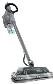
ORB13 13" Cordless Orbital HIL56035