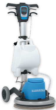
FMD20 Orbital 20" Orbital Floor Machine HIL56019