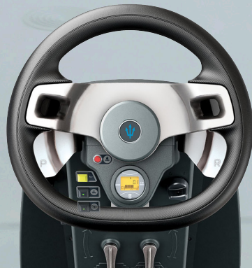
R30 Standard Controls