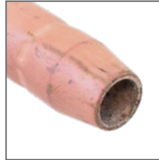
E-WELD PRE-COATED NOZZLES™