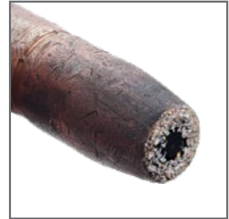
STANDARD OEM NOZZLE FULLY CLOGGED