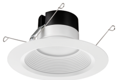
6RLD Static Downlight