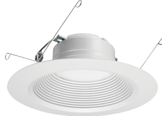
J6RL Static Downlight