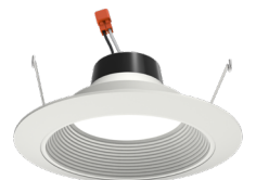
6RLA Static Adjustable