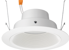
6G1 Static Adjustable