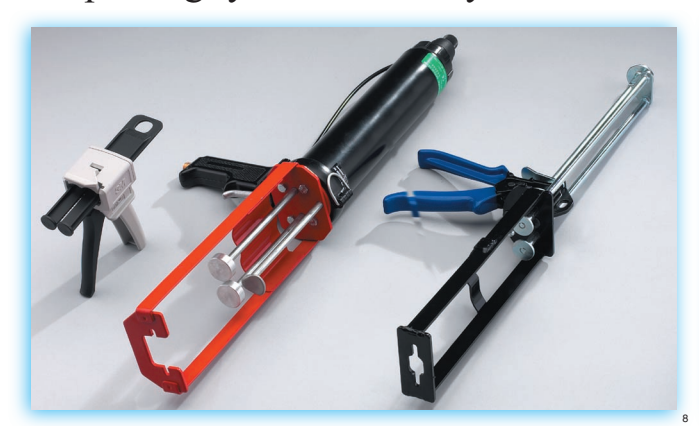
Left to right: Lightweight 3M™ EPX™ Plus II Applicator for low volume applications with 50 ml Duo-Pak cartridges. 12 fl. oz. pneumatic applicator and 12 fl. oz. manual applicator for higher volume applications with 12 oz. Duo-Pak cartridges. Commercially available bulk equipment for use with 5-gallon pails (at right) and 55 gallon drums.