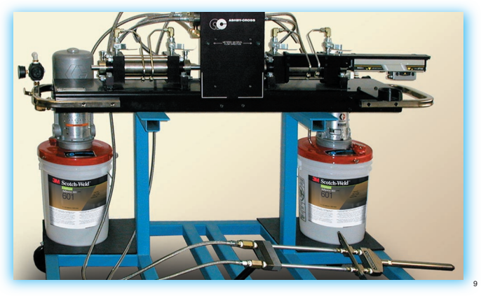
NOTE : The technical information and data provided above is a general guide only and should be considered representative or typical only and should not be used for specification purposes.