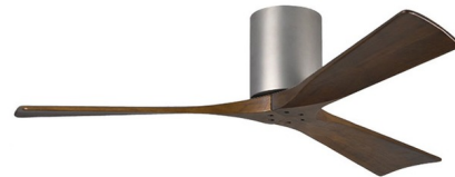
Shown in brushed nickel / walnut tone

The Atlas Irene Hugger Ceiling Fan is rustic yet strikingly modern, with cleanly joined solid wood blades and a minimal cylindrical motor housing. Its streamlined profile with the warm, natural look of wood works beautifully in contemporary and transitional spaces. Equipped with a DC motor, the fan is energy efficient and ultra-quiet. A hand-held remote control and wall control are included, both able to turn the motor on/off and set 6 speeds and forward/reverse. For fans that have a light, the controls also turn the light on/off and dims it. Fans that have a light include a cap matching the housing finish for no-light use. Note: Some combinations of motor finish, blade color, and light option are not available. The 72 inch is available in a 3-blade only and is not available with a light option.