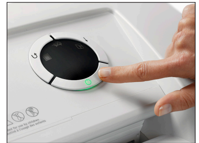
The command dial controls power up, reverse, and continuous run functions.