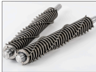
Aggressive cutting edges provide grip, and superior shredding performance.