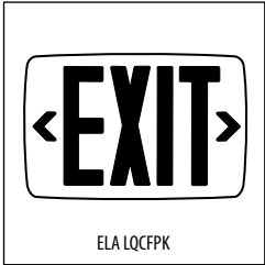
Faceplate accessory kit with red and green sign panels for 1-face to 2-face field conversion.