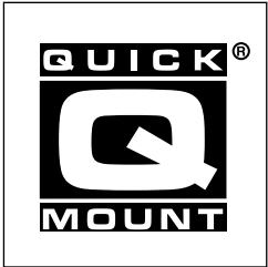
Quick-Mount installation less than 5 minutes.