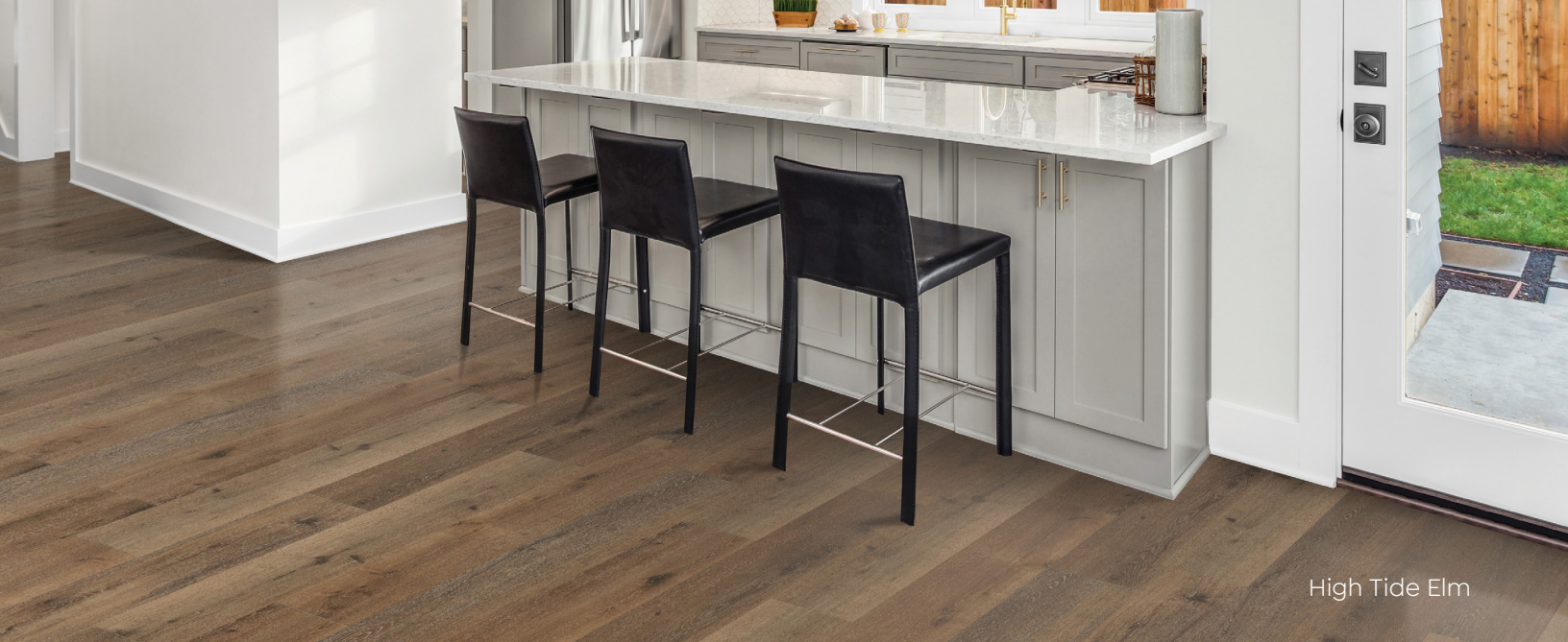
High Tide Elm