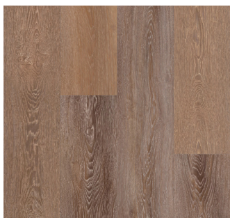
Tidal Pool Pine