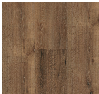
High Tide Elm