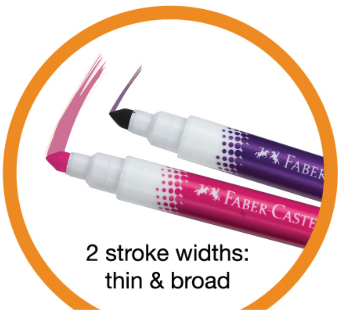
2 stroke widths: thin & broad

DuoTip markers have a special marker nib that can make both thin and broad stroke widths; perfect for a variety of arts and crafts projects.