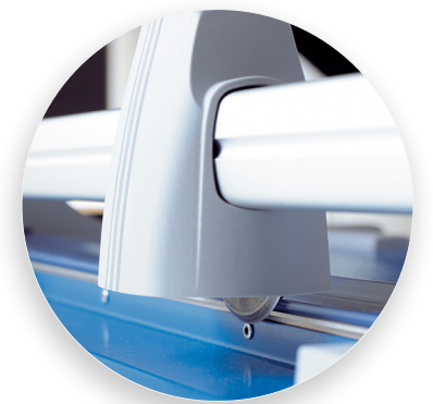
Self-sharpening system maintains a perfectly honed blade.