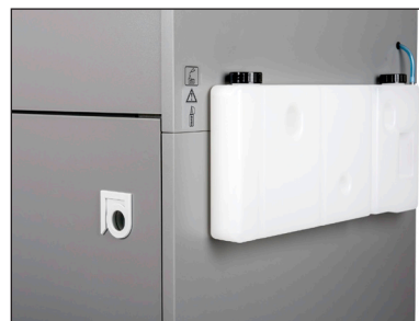
The 1 gallon EvenFlow Lubricator provides continuous lubrication for peak performance.

Fewer things are more frustrating than a paper jam. With automatic jam protection, this shredder prevents those annoyances. If sheet capacity is exceeded, the motor automatically stops and reverses to push the paper back out. This prevents a jam and makes it easy to re-feed fewer sheets.