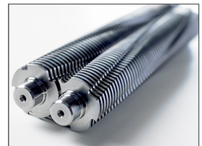
The cutting cylinders are milled from a solid bar of German Solingen steel for strength.