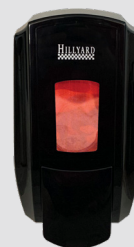
Black Dispenser HIL22304