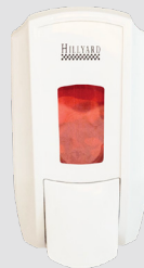
White Dispenser HIL22303