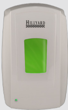
White Dispenser HIL22410