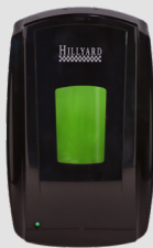
Black Dispenser HIL22411