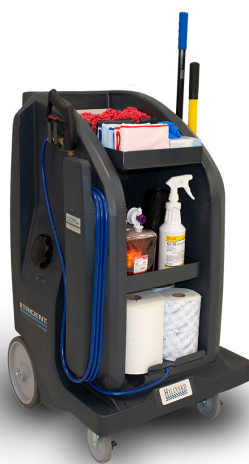
CC17XPC Corded HIL99247