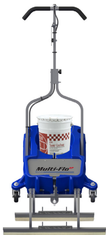
For Solvent-Based Gym Finish HIL50108