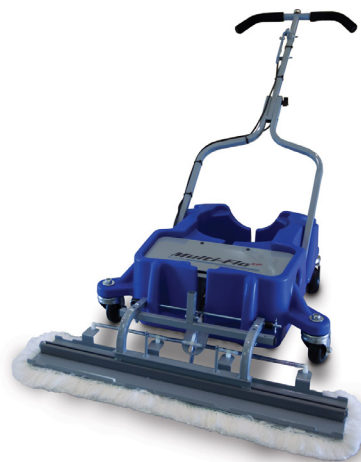
For Floor Finish HIL50110