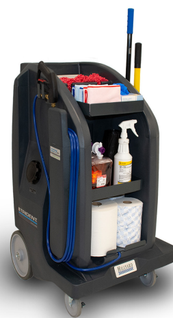
CC17HP Battery Powered High Pressure (275 PSI) HIL99246