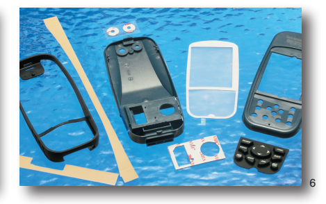
For ease of assembly and precise fit, die-cut 3M^{\infty} VHB<sup> \infty </sup> Tape bonds and seals plastic components throughout a GPS unit.