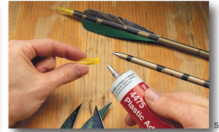
In bonding plastic feathers and nocks onto arrow shafts, 3M<sup>™</sup> Scotch-Weld<sup>™</sup> Industrial Plastic Adhesive 4475 dries quickly to a firm bond that resists plasticizers and water.