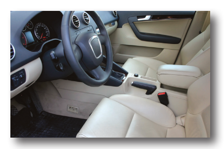
For thin bondlines in automotive interior trim attachment, 3M<sup>™</sup> Quick Bonding Adhesive 360 bonds with strength greater than many thicker tapes.