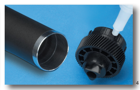
3M<sup>TM</sup> Scotch-Weld<sup>TM</sup> Plastic & Rubber Instant Adhesive PR600 permanently bonds difficultto-bond plastics and rubbers together, or in combination with metals and/or composites.