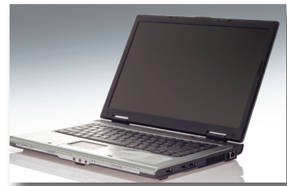
3M<sup>st</sup> Scotch-Weld<sup>st</sup> Epoxy Adhesive 8405 readily bonds many difficult-to-bond plastics in applications ranging from computers to signage.