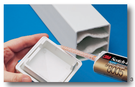
With no surface preparation, 3M^{ss} Scotch-Weld<sup>ss</sup> Structural Plastic Adhesive DP8005 bonds end caps on Low Surface Energy plastic fence posts. Handling strength in 2-3 hours.

*** Solvent-based adhesives may craze (attack) some surfaces.