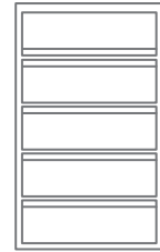
67.63" H x 18.63" D