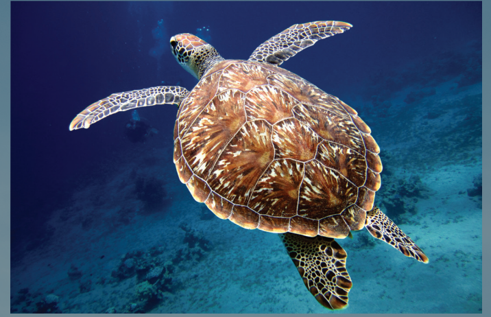
Related Words: aquatic, shell, reptile, retract