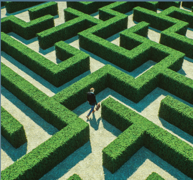
Related Words: puzzle, direction, memory, block, walls