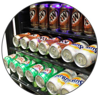
Shelves extend 30%