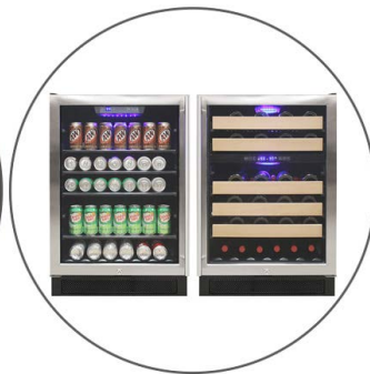
Shown paired with EL-46WCST