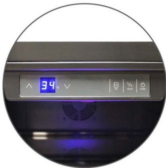
Temperature Control Panel