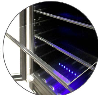
Tempered glass shelves