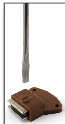
Adjust with screwdriver

Contact us for quantity pricing at sales@magnetsource.com