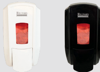
White Dispenser HIL22303