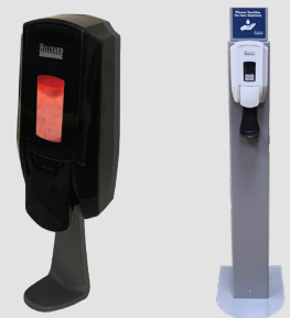
Clean Tray HIL22075 Color: Graphite Case Pack: 12