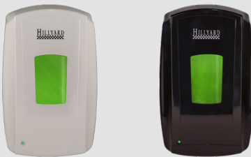
White Dispenser HIL22410