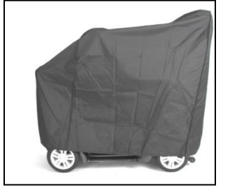
Protect your scooter from dirt and the elements with a cover fitted to your product's size