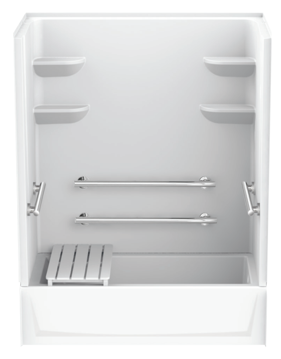
*Optional seat shown