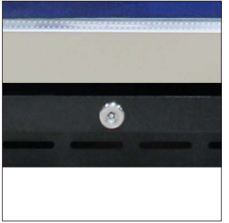
Integrated door lock secures contents