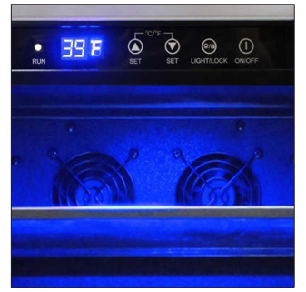
Fan forced cooling for temperature stability