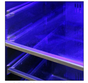
Adjustable tempered glass shelves with stainless look trim