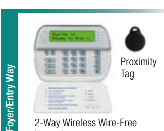
2-Way Wireless Wire-Free Keypad