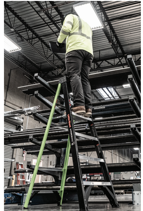
The Classic A-Frame, Elevated