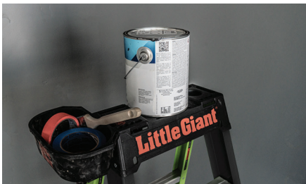
Wedge Lock System Secures Cans