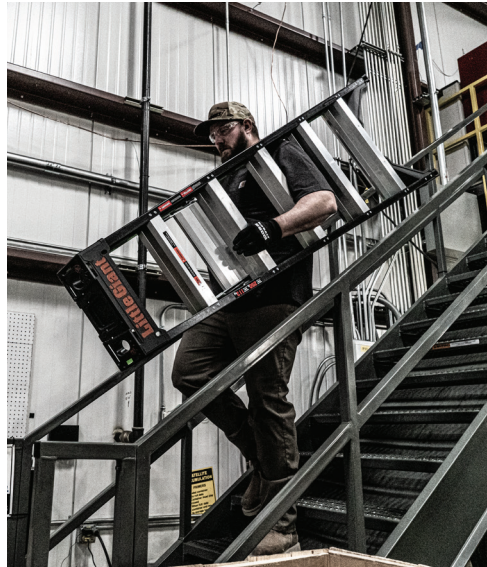
Lightweight for Easy Transport