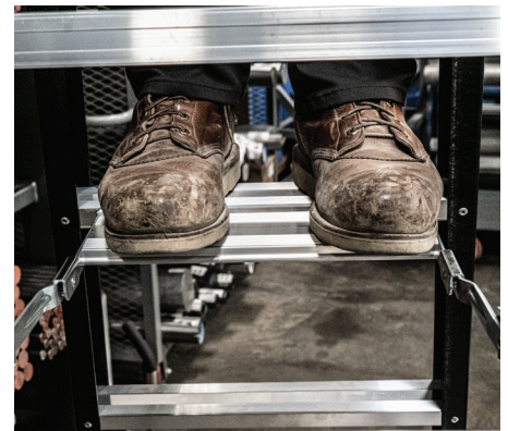
Extra Support and Foot Comfort