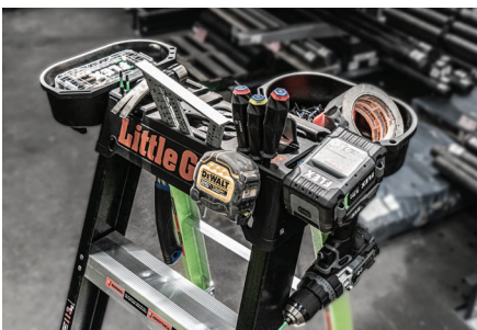
Top Cap Hold Tools and Accessories