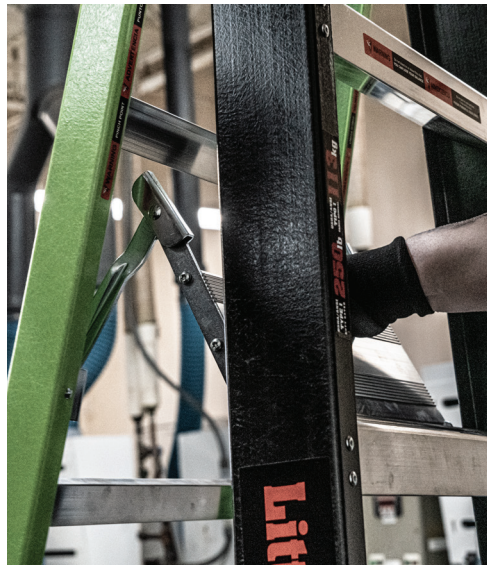
Simple Setup with Spreader Step