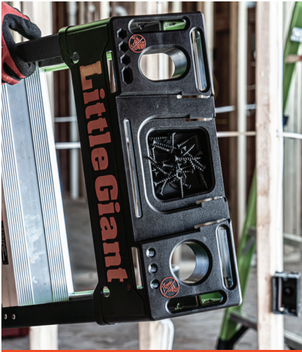
Magnetic Tray on Top Cap