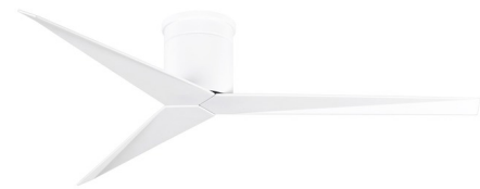
Shown in gloss white / gloss white