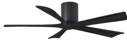
Shown in matte black / matte black

The Atlas Irene Hugger Ceiling Fan is rustic yet strikingly modern, with cleanly joined solid wood blades and a minimal cylindrical motor housing. Its streamlined profile with the warm, natural look of wood works beautifully in contemporary and transitional spaces. Equipped with a DC motor, the fan is energy efficient and ultra-quiet. A hand-held remote control and wall control are included, both able to turn the motor on/off and set 6 speeds and forward/reverse. For fans that have a light, the controls also turn the light on/off and dims it. Fans that have a light include a cap matching the housing finish for no-light use. Note: Some combinations of motor finish, blade color, and light option are not available. The 72 inch is available in a 3-blade only and is not available with a light option.