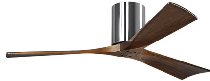
Shown in polished chrome / walnut tone

The Atlas Irene Hugger Ceiling Fan is rustic yet strikingly modern, with cleanly joined solid wood blades and a minimal cylindrical motor housing. Its streamlined profile with the warm, natural look of wood works beautifully in contemporary and transitional spaces. Equipped with a DC motor, the fan is energy efficient and ultra-quiet. A hand-held remote control and wall control are included, both able to turn the motor on/off and set 6 speeds and forward/reverse. For fans that have a light, the controls also turn the light on/off and dims it. Fans that have a light include a cap matching the housing finish for no-light use. Note: Some combinations of motor finish, blade color, and light option are not available. The 72 inch is available in a 3-blade only and is not available with a light option.