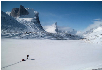
The South Pole

Ernest Shackleton was impetuous and restless, but also a man of endurance . In fact, that was the name of the ship on which Shackleton, with 28 crewmen, left England and set out to map the vast South Pole ice cap in 1914. While they were mapping the polar region, the Endurance became frozen in an ice pack and crushed. Shackleton and his 28 men escaped with most of their supplies. They salvaged timbers and other materials from the wreckage of their ship and made sledges . The men loaded the sledges with supplies and set out across the ice to find help. Shackleton's courageous band of men walked 180 miles to Elephant Island.