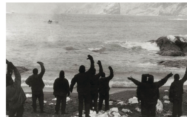
Shackleton's men on Elephant Island being rescued.

Examples: endurance, duty, courage, discouragement, fear