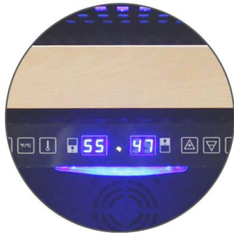
Temperature Control Panel