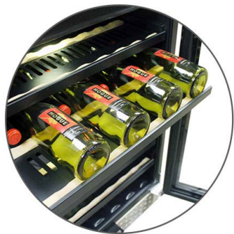
Shelves extend 30%