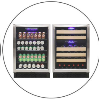
Shown paired with EL-46WCBC-L