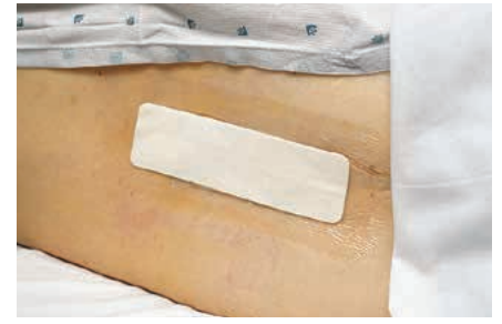
Tegaderm™ +Pad on epidural

*In vitro testing shows that the transparent film dressing provides a viral barrier from viruses 27 nm in diameter or larger while the dressing remains intact without leakage.