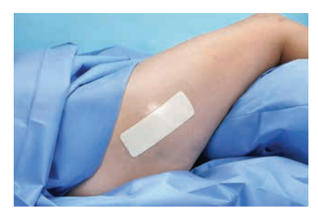
Tegaderm™ +Pad on hip incision