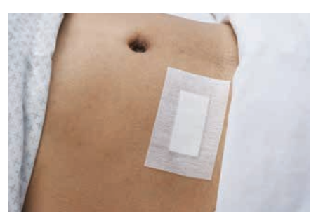
Medipore<sup>™</sup> +Pad on appendectomy