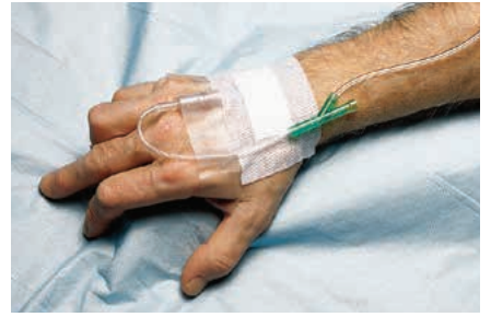
Medipore™ +Pad on IV catheter site