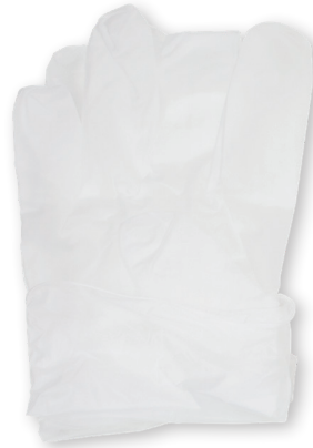
Pair of Vinyl Stretch Gloves Size L