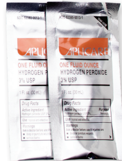
Aplicare Hydrogen Peroxide 1 oz. Pack