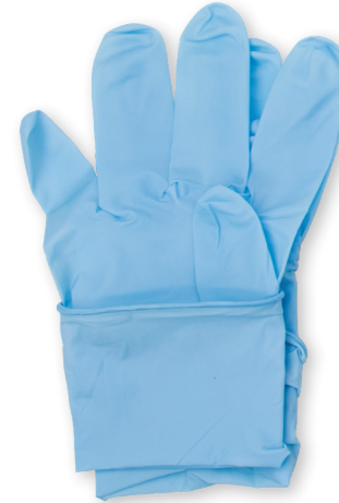
Pair of Nitrile Gloves Size M