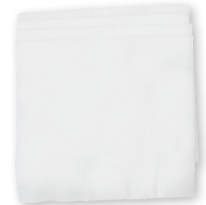
Non-Woven Gauze Size 4" x 4"