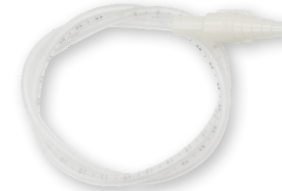
14 Fr. Suction Catheter