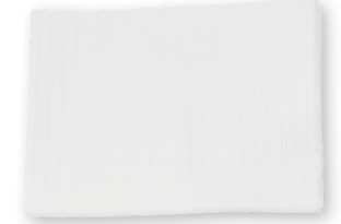
3-Ply Waterproof Drape Size 45 x 34 cm