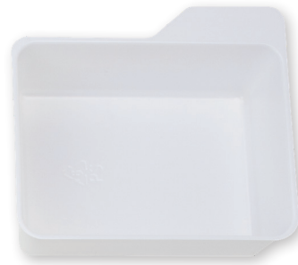
Removable Plastic Basin