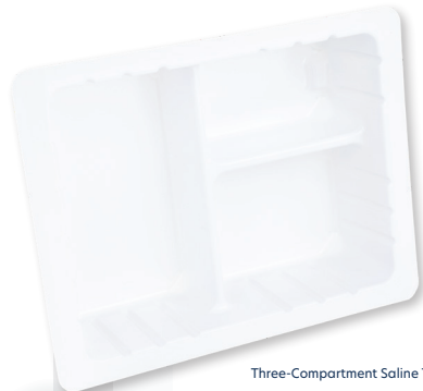
Three-Compartment Saline Tray