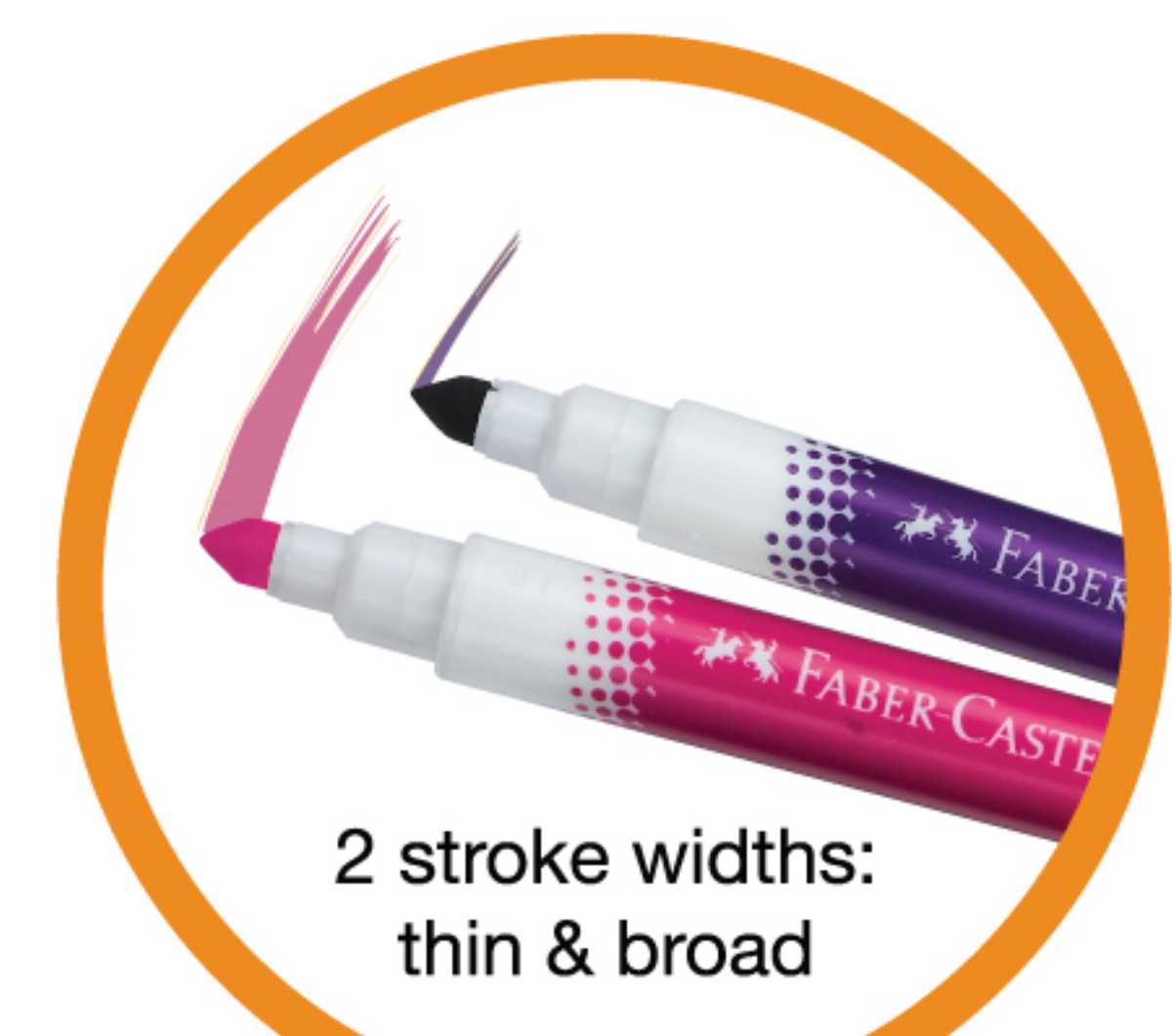
2 stroke widths: thin & broad

DuoTip markers have a special marker nib that can make both thin and broad stroke widths; perfect for a variety of arts and crafts projects.