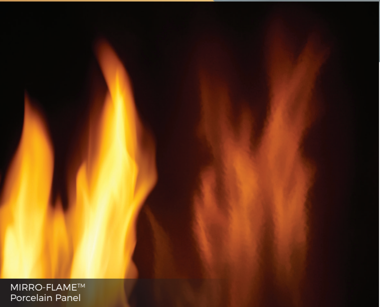
MIRRO-FLAME™ Porcelain Panel