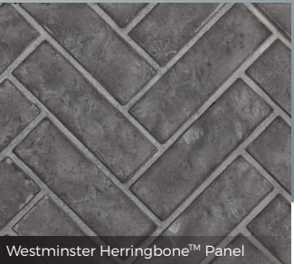
Westminster Herringbone™ Panel