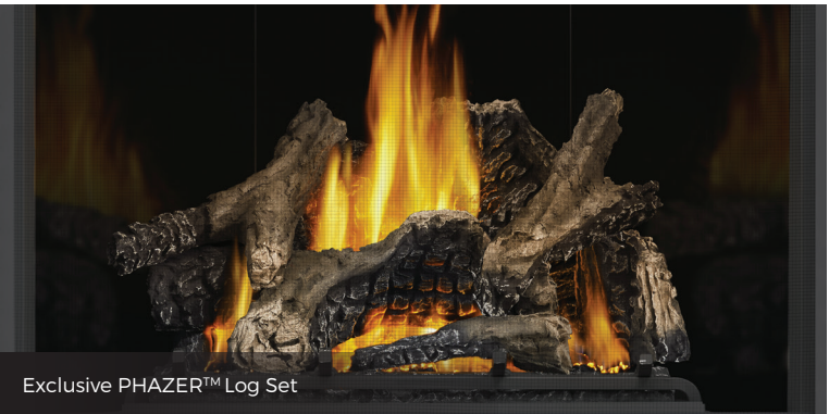
Exclusive PHAZER™ Log Set