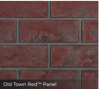
Old Town Red™ Panel