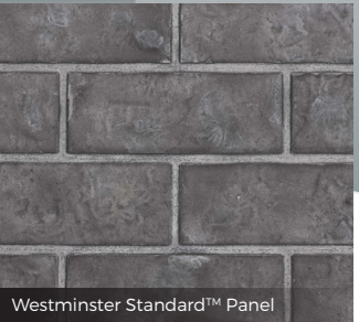
Westminster Standard™ Panel