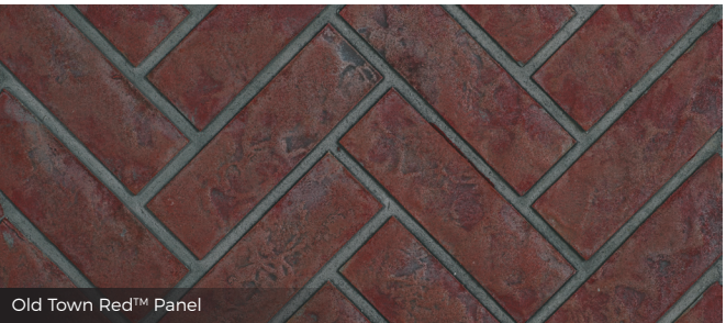
Old Town Red™ Panel

Panels and Brick Kits Optional MIRRO-FLAME™ Porcelain Radiant Panels, Newport™, Old Town Red™ Standard, Old Town Red™ Herringbone & Westminster™ Herringbone Brick Panels