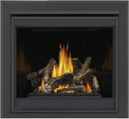
3" Premium Bevelled Trim